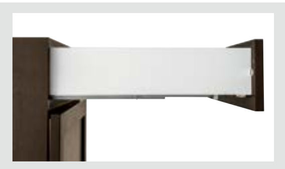
Melamine Drawer Box Option Our Melamine Drawer Box option offers the same features as the dovetail drawer box with the choice of a white or natural finish to match your cabinet interior.