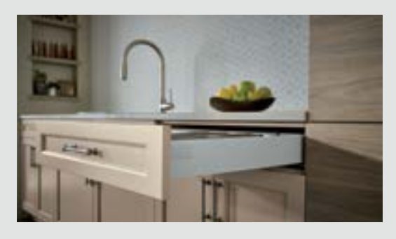
Metal Drawer Box Option Our Metal Drawer Box option offers the same features of the dovetail drawer but, with sleek double wall metal sides. It's the perfect choice for a clean, contemporary kitchen.